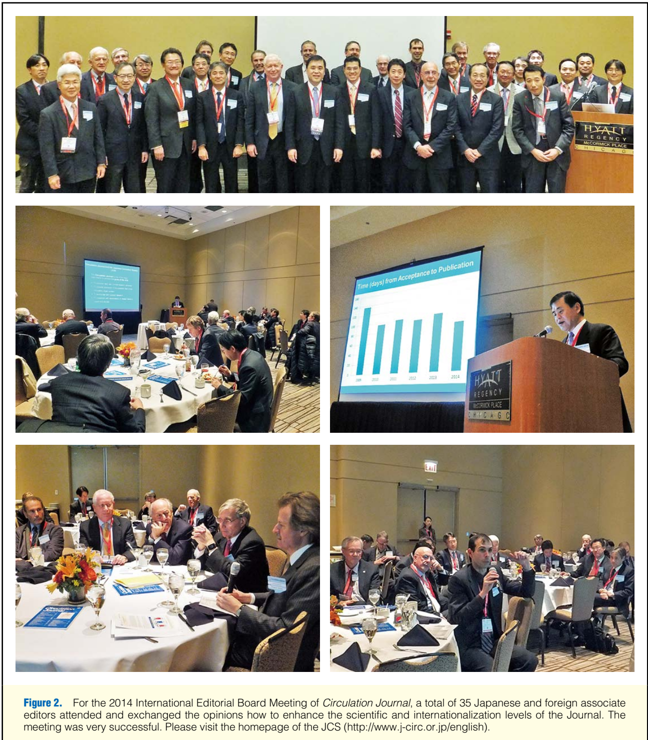
Figure 2. For the 2014 International Editorial Board Meeting of Circulation Journal , a total of 35 Japanese and foreign associate editors attended and exchanged the opinions how to enhance the scientific and internationalization levels of the Journal. The meeting was very successful. Please visit the homepage of the JCS ( http://www.j-circ.or.jp/english ).