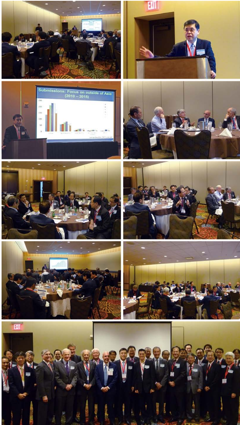
Figure 2. For the 2015 International Editorial Board Meeting of Circulation Journal , a total of 31 Japanese and foreign associate editors attended and exchanged the opinions how to enhance the scientific and internationalization levels of the Journal. The meeting was very successful. Please visit the homepage of the JCS ( http://www.j-circ.or.jp/english ).